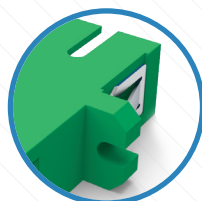
SC One Piece Adapter No Weld Type